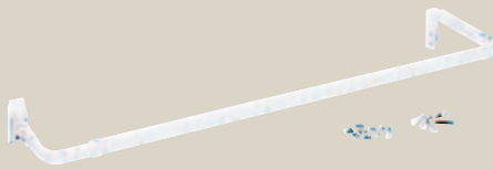
Standard Finish 025 white 6½" - 8½" Return Clearance 6¼" - 8¼"