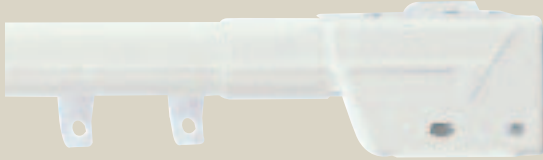
Finish 025 white Single Two-Way Draw