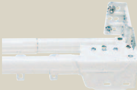
Finish 025 white Two-Way Draw and Plain Rod Set