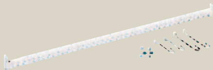
Finish 025 white